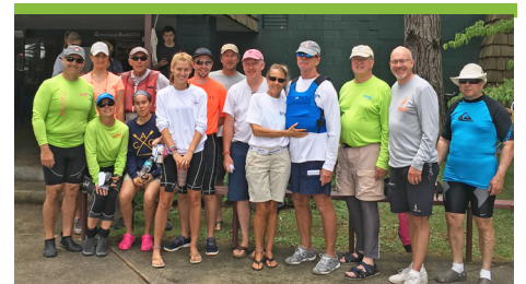
Pymatuning Yacht Club Independence Day Regatta sailors.