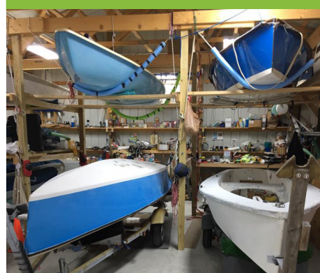
The work of the First family never ends! Boat prep year 'round!